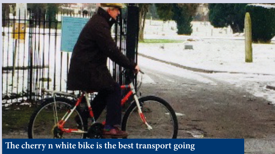
The cherry n white bike is the best transport going