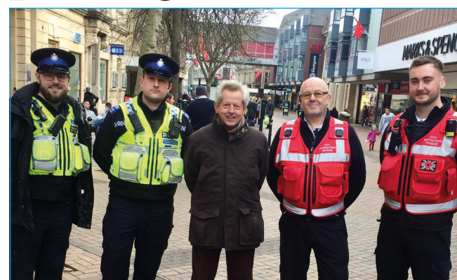
More visible policing in our city centre: PCSOs and CPOs together