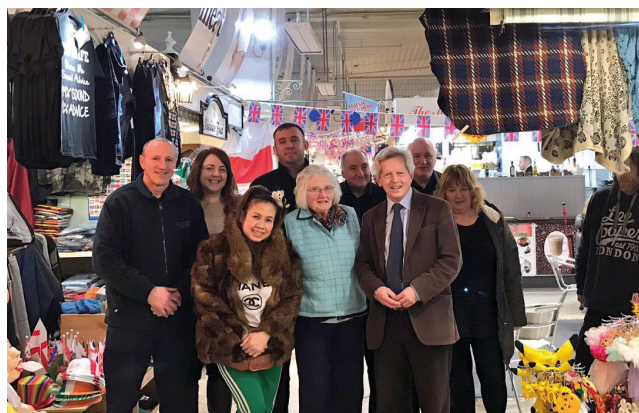
With the city council team and traders in Eastgate Market