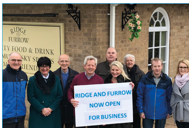
Celebrating the re-opening of the Ridge & Furrow