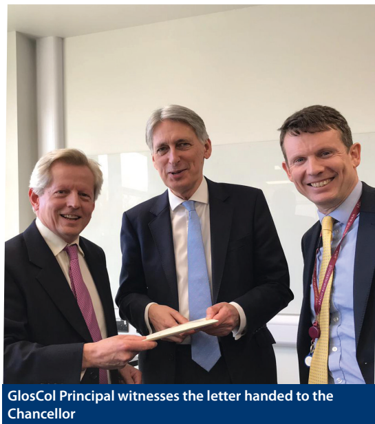
GlosCol Principal witnesses the letter handed to the Chancellor

Gloucester's MP said 'Now that we've resolved NHS funding, this is the time to do more on education. Every school is getting more money per pupil than they did last year. But their costs - mostly teachers' salaries and taxpayer contributions to their pensions - are rising faster, so we need to help them at the same time.'