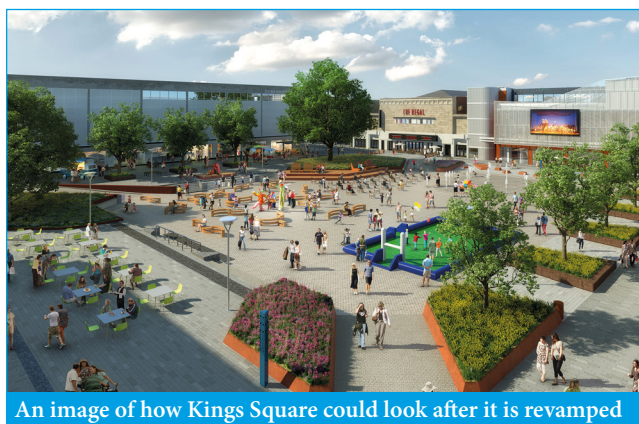
An image of how Kings Square could look after it is revamped