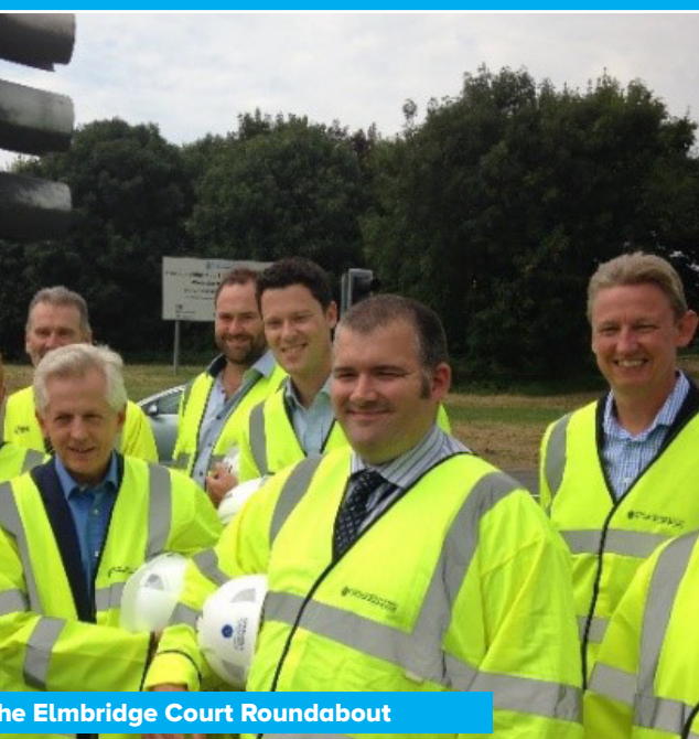
the Elmbridge Court Roundabout

"2014 government and county council funded improvements to the Walls and C&G roundabouts made a real difference to drivers", said MP Richard Graham, "and now we're doing the same at the Elmbridge Court roundabout and will do at the Over roundabout."