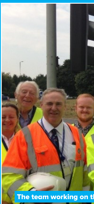
The team working on the