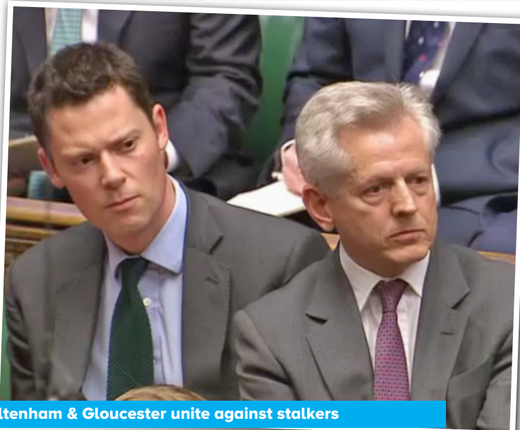
Cheltenham & Gloucester unite against stalkers