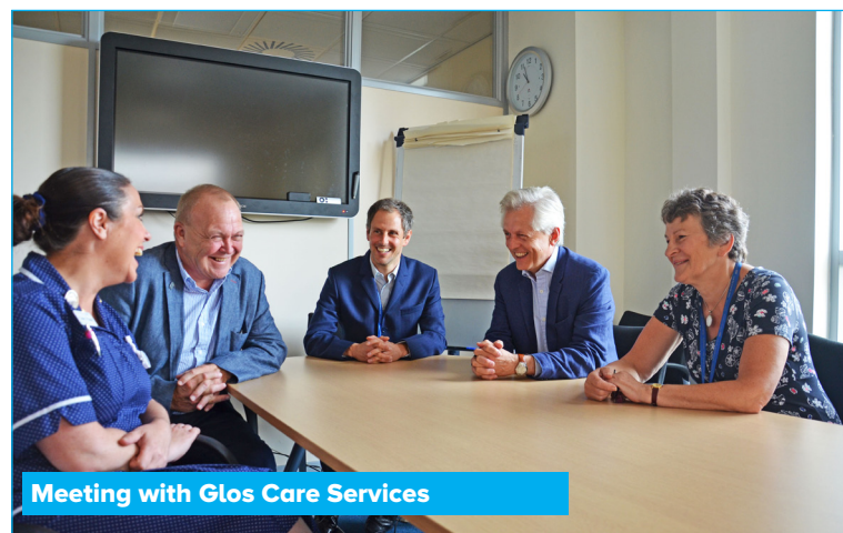
Meeting with Glos Care Services

"The issue that needs to be resolved," Gloucester's MP noted, "is the £30m black hole in the NHS Hospitals Trust finances which is under investigation at the moment. Once the new management and the Health Department have resolved this in January, the Gloucestershire Royal Hospital can get on with benefiting from all the positive things that hard working staff do."