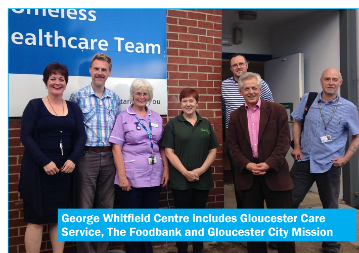
George Whitfield Centre includes Gloucester Care Service, The Foodbank and Gloucester City Mission