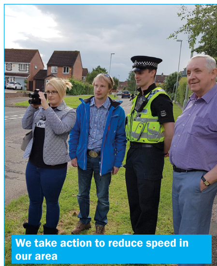
We take action to reduce speed in our area

Others areas the Police have tackled include Heron Way, Bittern Avenue and stretches off Abbeymead Avenue. We continue to look at other ways to reduce speeding, and we're looking at working with local schools to see who can design the best poster, as well as looking at Traffic calming measures.