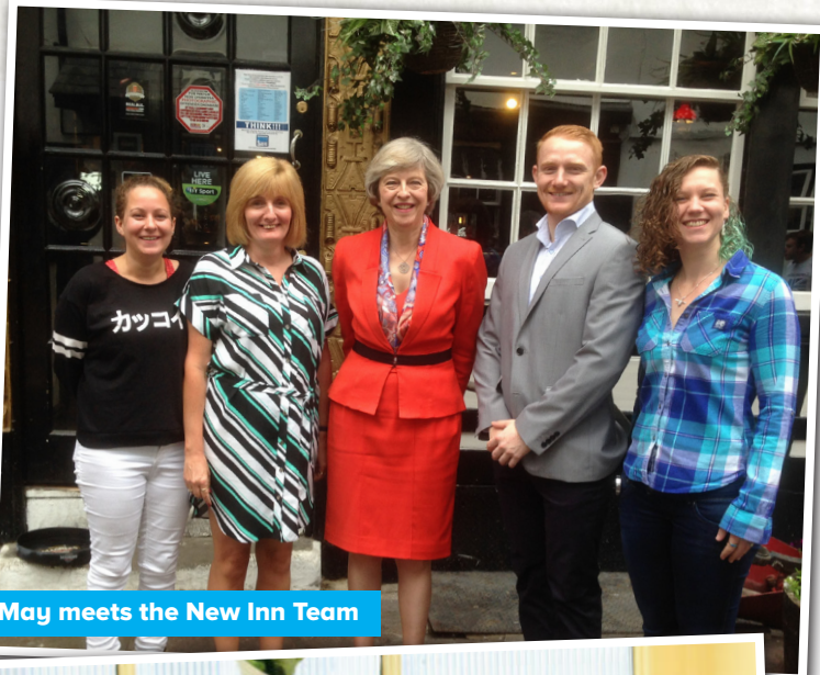
Mrs May meets the New Inn Team

Glos Fire offer a free visit to check and replace your alarms, and a free Safe and Well visit to discuss all aspects of home safety, including your own health. Call them on 0800 180 41 40 or do your own self-assessment on their website.