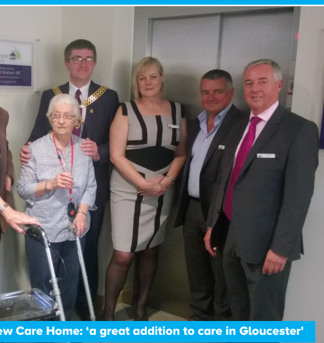
New Care Home: 'a great addition to care in Gloucester'