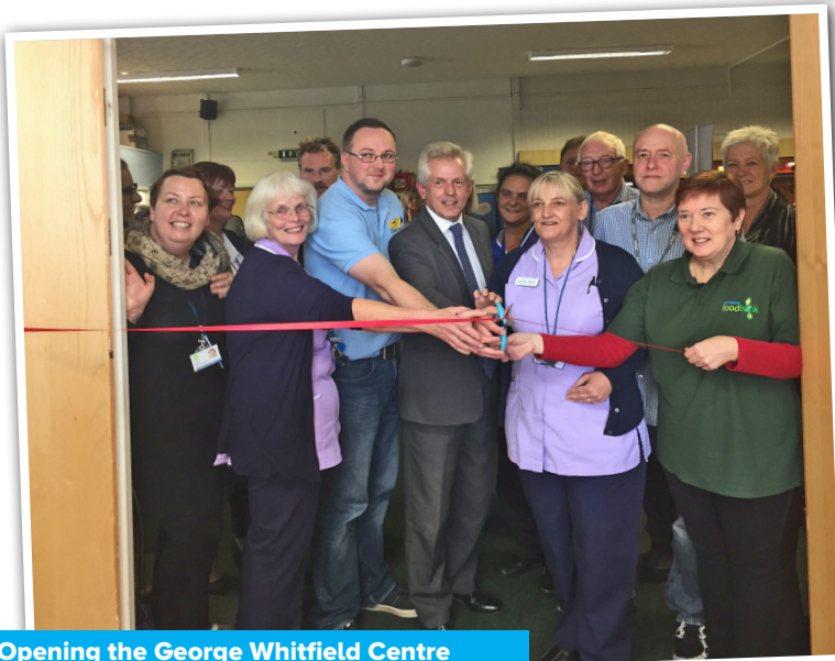
Opening the George Whitfield Centre